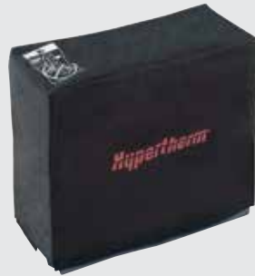
System dust cover