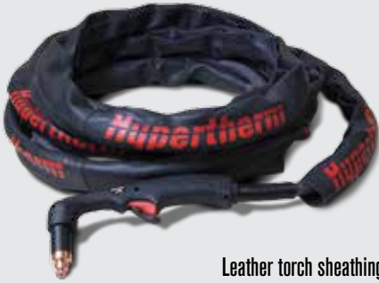
Leather torch sheathing