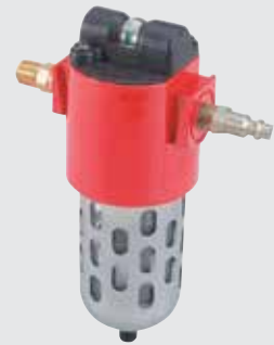
Air filtration kit

Environmental stewardship is a core value of Hypertherm. Our Powermax products are engineered to meet and exceed global environmental regulations including the RoHS directive.